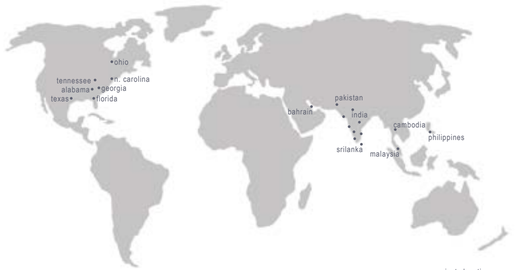
projects location map